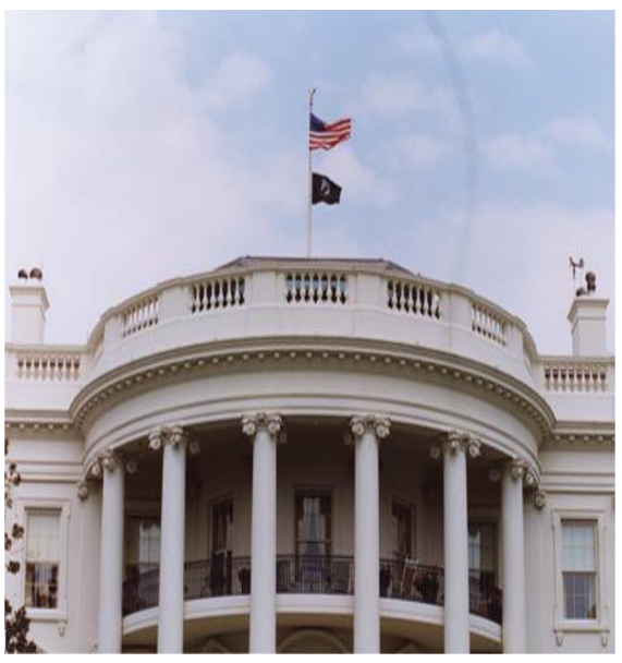
POW/MIA Flag flying over White House – National POW/MIA Recognition Day, 1993